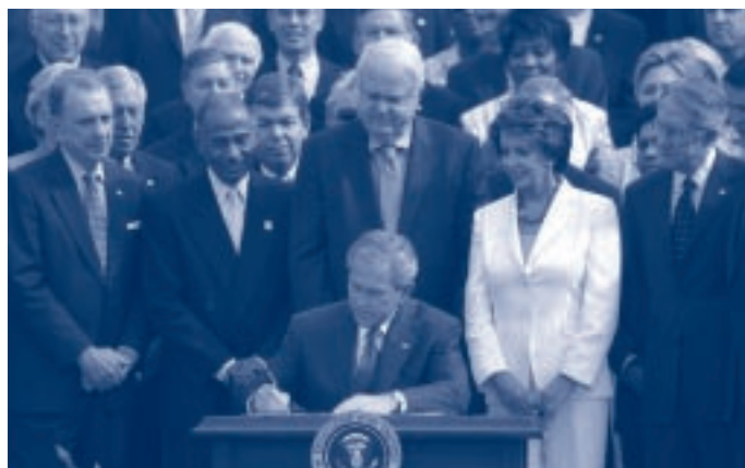
Surrounded by members of the U.S. House and Senate, President George W. Bush signed into law the Fannie Lou Hamer, Rosa Parks and Coretta Scott King Voting Rights Act Reauthorization and Amendments Act of 2006. Show is CBC member Rep. John Conyers, Jr., Ranking Member of the House Judiciary Committee.