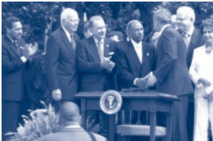
Members of the U.S. Congress from the Senate and House gathered in the Rose Garden of the White House for the signing of the Voting Rights Bill by President George W. Bush, who shakes the hand of Rep. John Conyers, Jr., the Ranking Member of the House Judiciary Committee. At the far left is CBC Chairman Rep. Melvin L. Watt.

Rep. John Conyers, Ranking Member of the House Judiciary Committee, said, "With the passage of the Voting Rights Reauthorization Act, our nation makes the commitment to protecting the right to vote