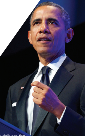
President Obama delivers the 44th Annual Phoenix Awards Dinner keynote

Our Annual Legislative Conference (ALC) is the leading policy conference for thought leaders, legislators and concerned citizens who want to engage in challenging conversations and find solutions to the problems within the African-American community. We offer more than 70 public policy forums on economic development, health, education and civil and social justice issues. Nearly 20,000 people attend ALC forums and activities. The ALC is a unique opportunity to make your voice heard on the issues that matter most to today's African-American communities.