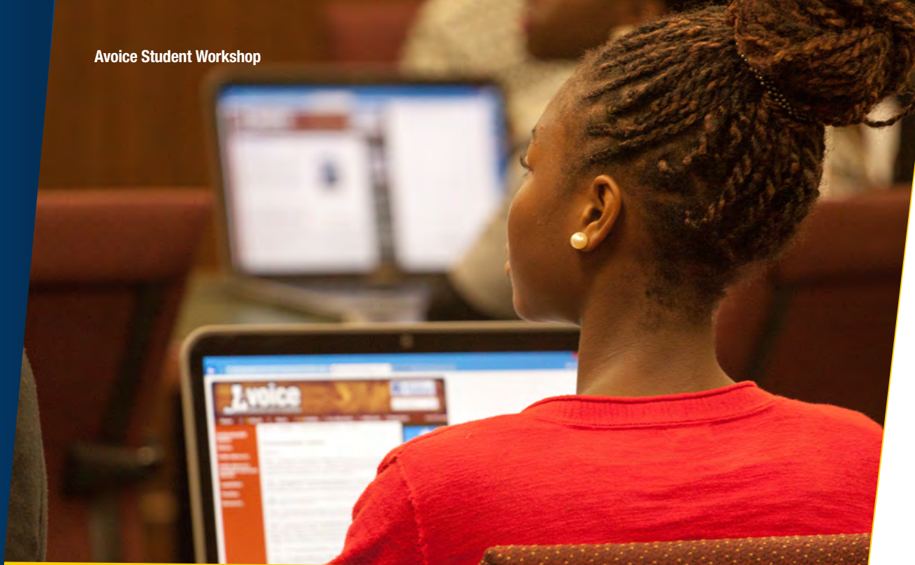
Avoice Student Workshop

Avoice launched its newest online exhibit, Fair Housing, which includes a comprehensive timeline of the Congressional Black Caucus' role in creating and enforcing fair housing policy. Avoice also explored the Congressional Black Caucus's role in the passage and implementation of the Civil Rights Act during the 44th ALC.