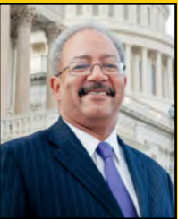
Rep. Chaka Fattah Member of Congress Chair, CBCF Board of Directors