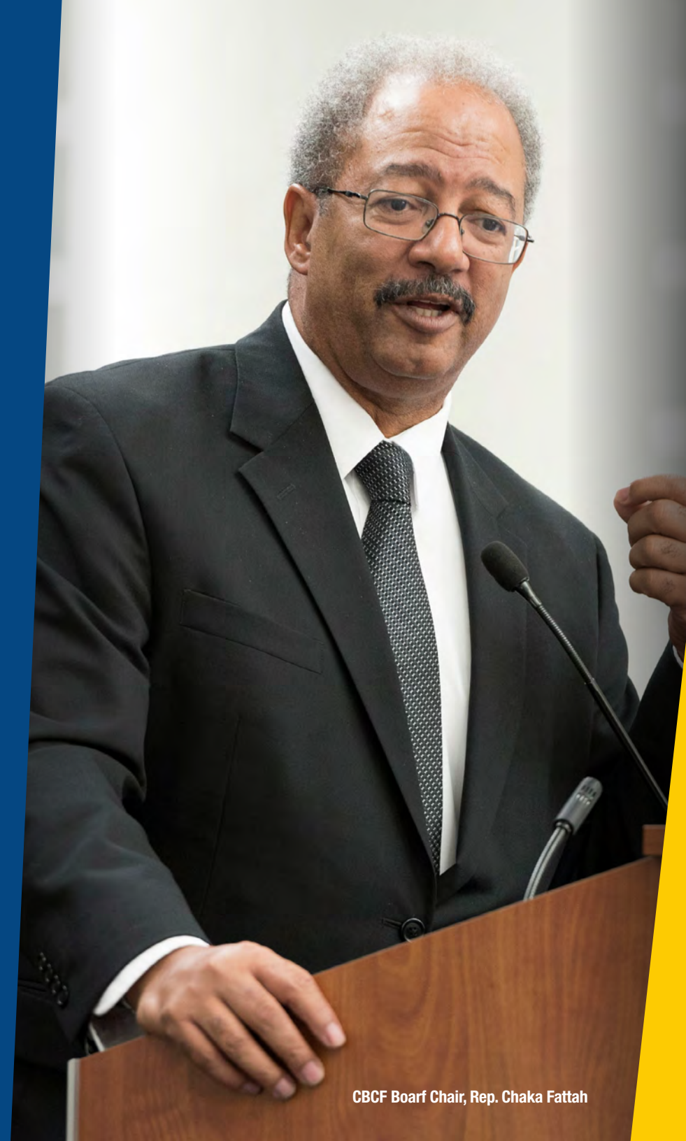
CBCF Board Chair, Rep. Chaka Fattah

The fall convening of the Health Braintrust took place on September 26 during the CBCF 44th Annual Legislative Conference with the theme, "Achieving Health Equity: Moving from Goal to Reality." It covered several health policy, public health and health care issues critical to eliminating health disparities and achieving health equity in the U.S. More than 400 people attended the meeting, which also marked the end of the tenure of Del. Donna M. Christensen as chair of the Health Braintrust. She passed the torch to her successor, Rep. Robin Kelly.