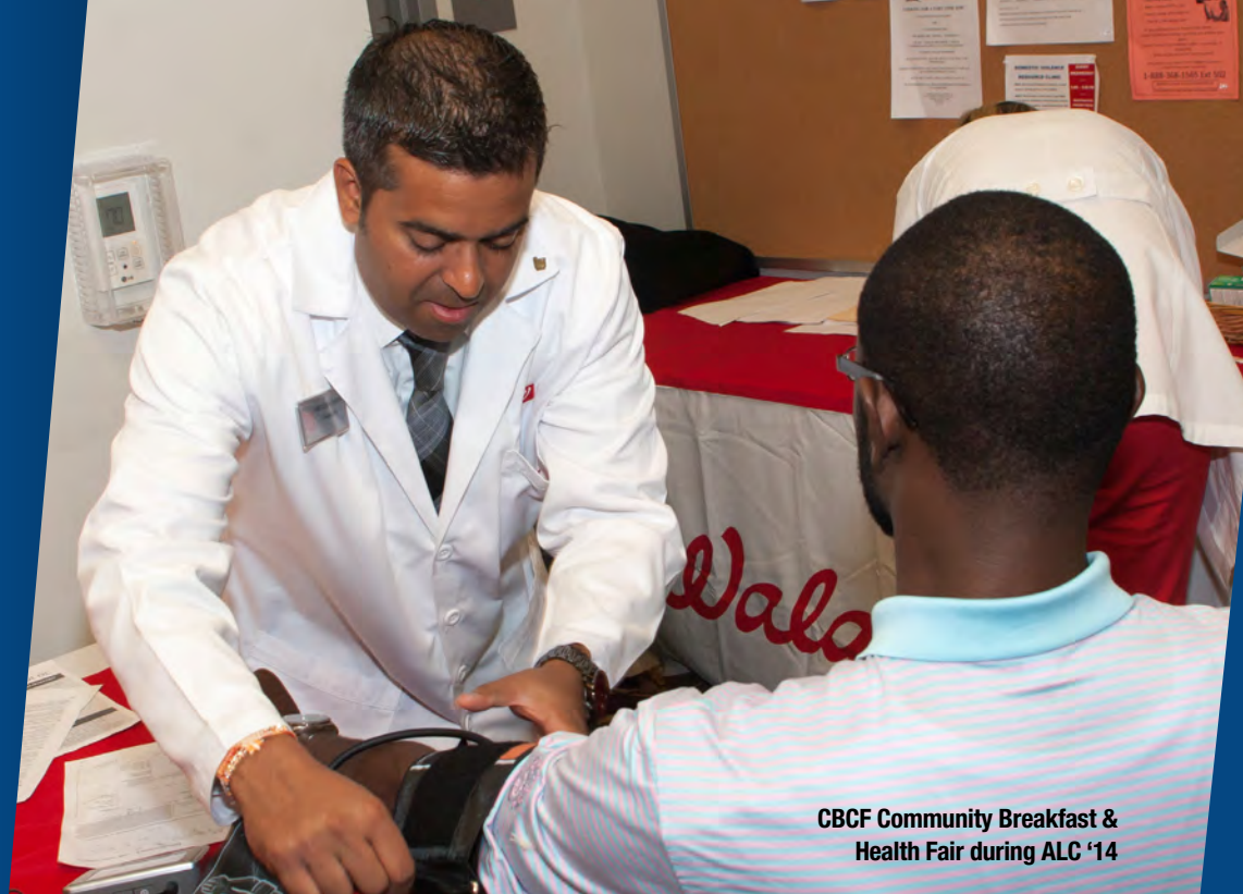
CBCF Community Breakfast & Health Fair during ALC '14

As the Affordable Care Act (ACA) is implemented across the nation, African Americans continue to be affected by historical disparities in access to healthcare. The CBCF remains focused on addressing the health and well-being of black populations. Our programs, which focus on the importance of preventive health, have educated hundreds about vital health-related issues, provided access to resources and testing, and started many on paths to improved health and wellness.