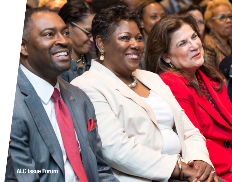
ALC Issue Forum