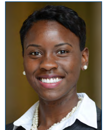
CBCF Communications Intern, Fall 2013

The strength of the internship programs creates an ever-lasting bond between the CBCF and alumni. I am thankful to be a part of an organization that invested in me and in communities around the world.