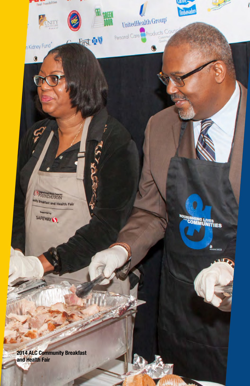
2014 ALC Community Breakfast and Health Fair