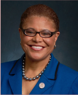
REP. KAREN BASS