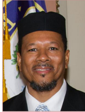
IMAM TALIB SHAREEF