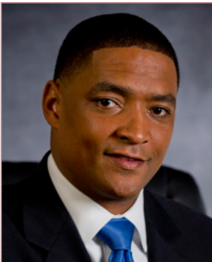
REP. CEDRIC L. RICHMOND

President and CEO Congressional Black Caucus Foundation, Inc.