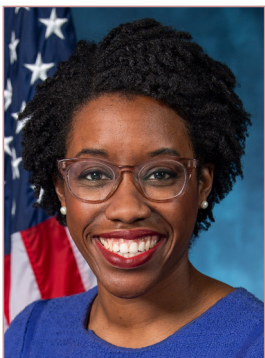
REP. LAUREN UNDERWOOD

Honorary Co-Chair 2019 Annual Legislative Conference