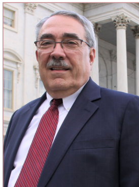
REP. G. K. BUTTERFIELD

Honorary Co-Chair 2019 Annual Legislative Conference