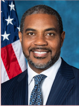
REP. STEVEN HORSFORD