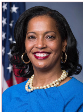
REP. JAHANA HAYES

CBCF Leadership Institute Alumna Member of Congress