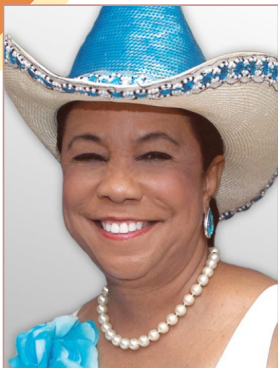
REP. FREDERICA S. WILSON

Honorary Co-Chair 2019 Annual Legislative Conference