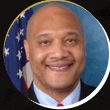
Rep. André Carson IN-07