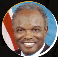
Rep. David Scott GA-13