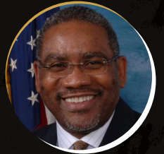
Rep. Gregory W. Meeks NY-05