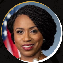
Rep. Ayanna Pressley MA-07