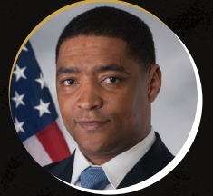
Rep. Cedric Richmond LA-02