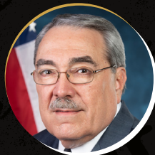
Rep. G.K. Butterfield NC-01