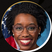
Rep. Lauren Underwood IL-14