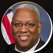
Rep. A. Donald McEachin VA-04