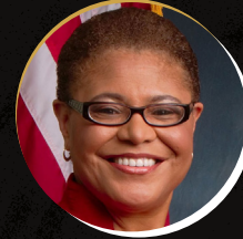
Rep. Karen Bass CA-37