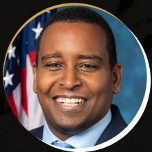
Rep. Joe Neguse CO-02