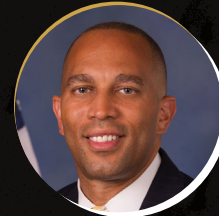
Rep. Hakeem Jeffries NY-08