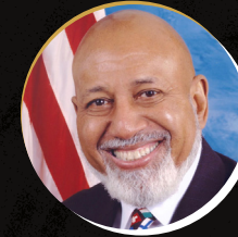
Rep. Alcee L. Hastings FL-20