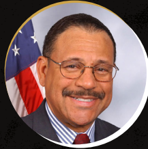
Rep. Sanford D. Bishop, Jr. GA-02