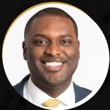
Rep. Mondaire Jones NY-17