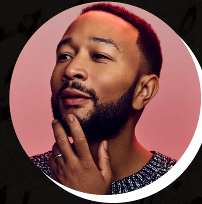
John Legend Singer/Songwriter