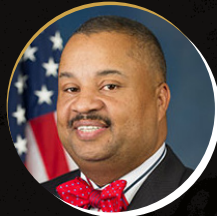
Rep. Donald M. Payne, Jr. NJ-10