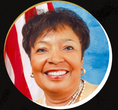
Rep. Eddie Bernice Johnson TX-30