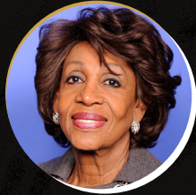
Rep. Maxine Waters CA-43