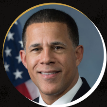
Rep. Anthony Brown MD-04