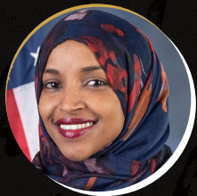
Rep. Ilhan Omar MN-05