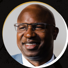
Rep. Jamaal Bowman NY-16