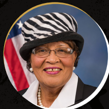
Rep. Alma Adams NC-12