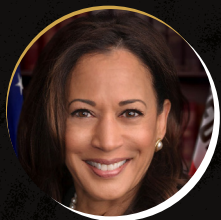
Sen. Kamala D. Harris CA