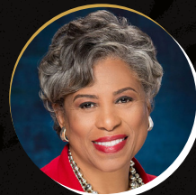
Rep. Brenda Lawrence MI-14