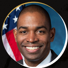
Rep. Antonio Delgado NY-19