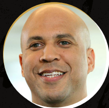
Sen. Cory Booker NJ