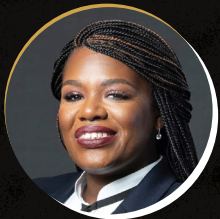
Rep. Cori Bush MO-01