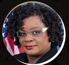
Rep. Gwen Moore WI-04