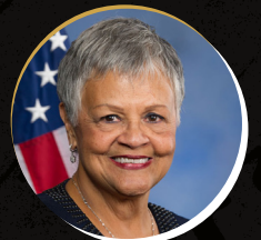
Rep. Bonnie Watson Coleman NJ-12