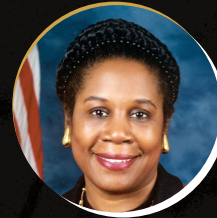
Rep. Sheila Jackson Lee TX-02