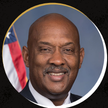
Rep. Dwight Evans PA-02