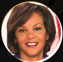
Rep. Robin Kelly IL-02