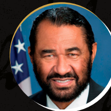
Rep. Al Green TX-09