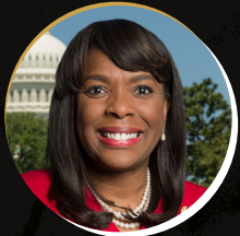
Rep. Terri Sewell AL-07