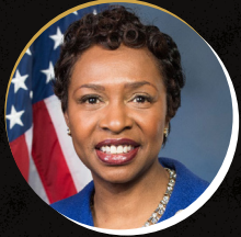
Rep. Yvette D. Clarke NY-09