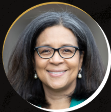
Rep. Marilyn Strickland WA-07