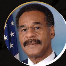
Rep. Emanuel Cleaver II MO-05