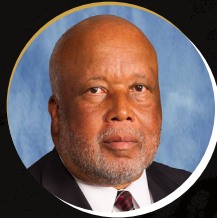
Rep. Bennie G. Thompson MS-02