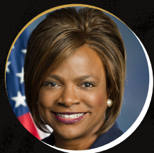
Rep. Val Demings FL-10