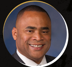
Rep. Marc Veasey TX-33