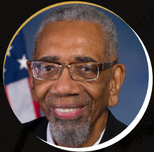
Rep. Bobby L. Rush IL-01