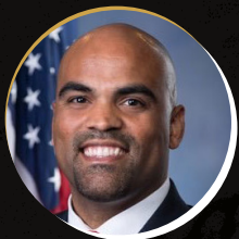
Rep. Colin Allred TX-32