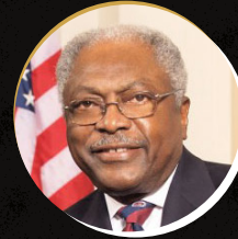
Rep. James E. Clyburn SC-06