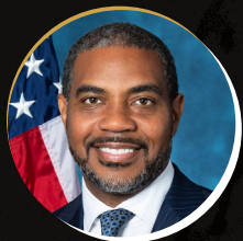
Rep. Steven Horsford NV-04