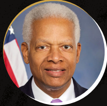
Rep. Hank Johnson GA-04