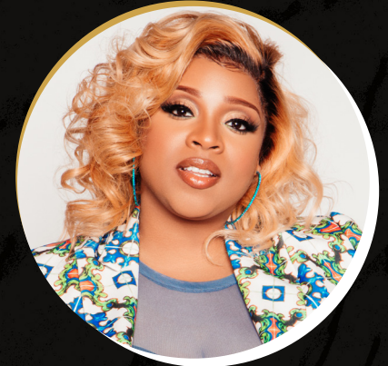
Kierra Sheard-Kelly Singer/Songwriter