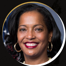
Rep. Jahana Hayes CT-05