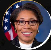
Rep. Marcia L. Fudge OH-11