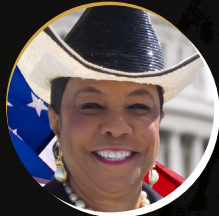
Rep. Frederica Wilson FL-24