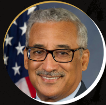
Rep. Robert C. "Bobby" Scott VA-03