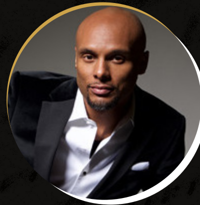
Kenny Lattimore Singer/Songwriter