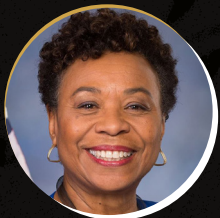
Rep. Barbara Lee CA-13