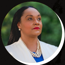
Rep. Nikema Williams GA-05