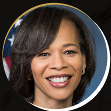
Rep. Lisa Blunt Rochester DE