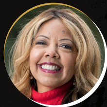
Rep. Lucy McBath GA-06