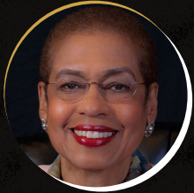
Del. Eleanor Holmes Norton DC