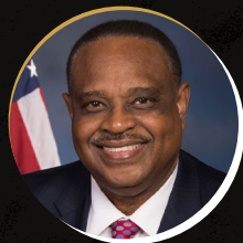
Rep. Al Lawson FL-05