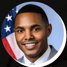
Rep. Ritchie Torres NY-15