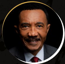
Rep. Kweisi Mfume MD-07