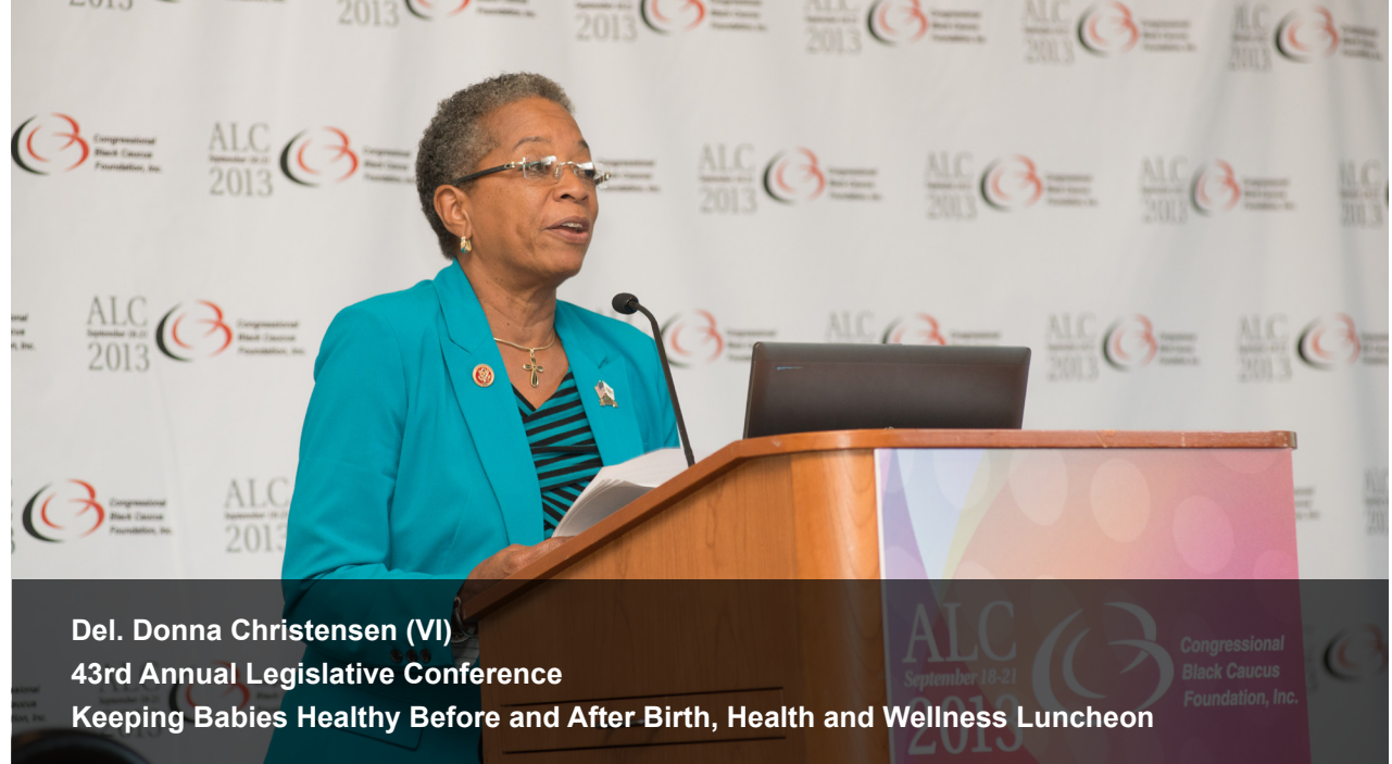
Del. Donna Christensen (VI) 43rd Annual Legislative Conference Keeping Babies Healthy Before and After Birth, Health and Wellness Luncheon