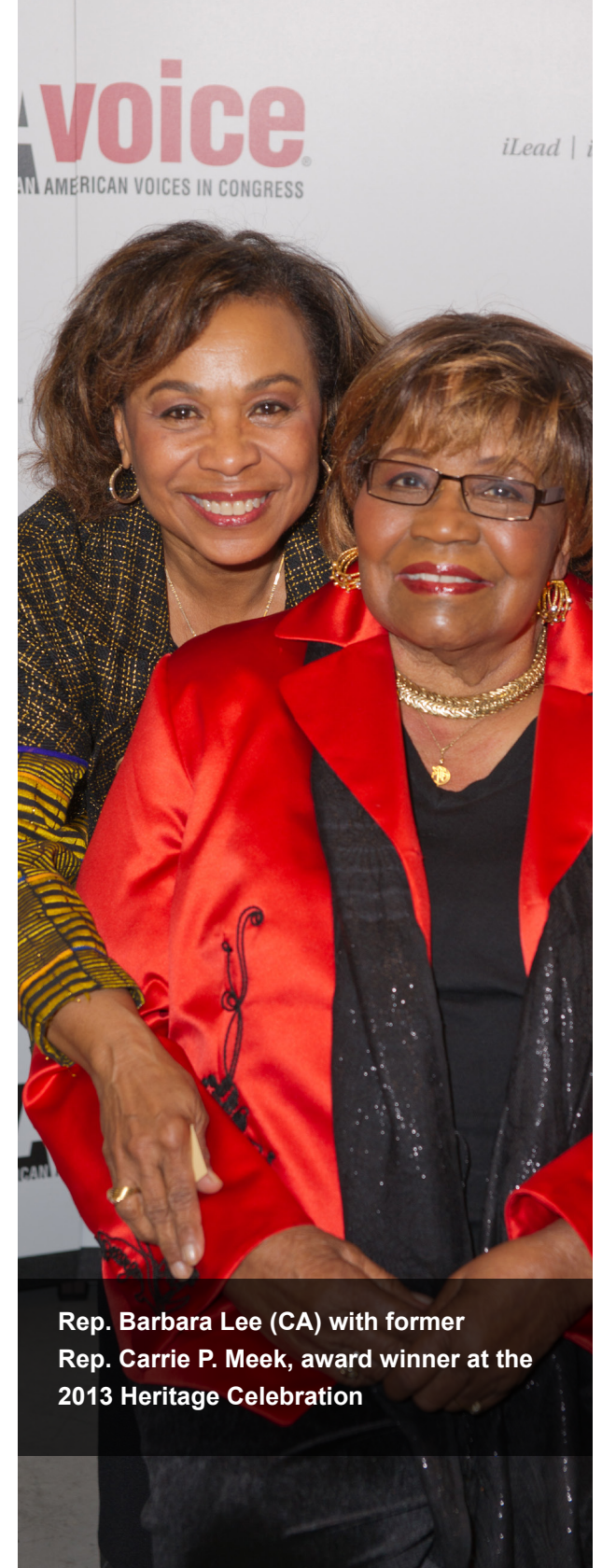
Rep. Barbara Lee (CA) with former Rep. Carrie P. Meek, award winner at the 2013 Heritage Celebration