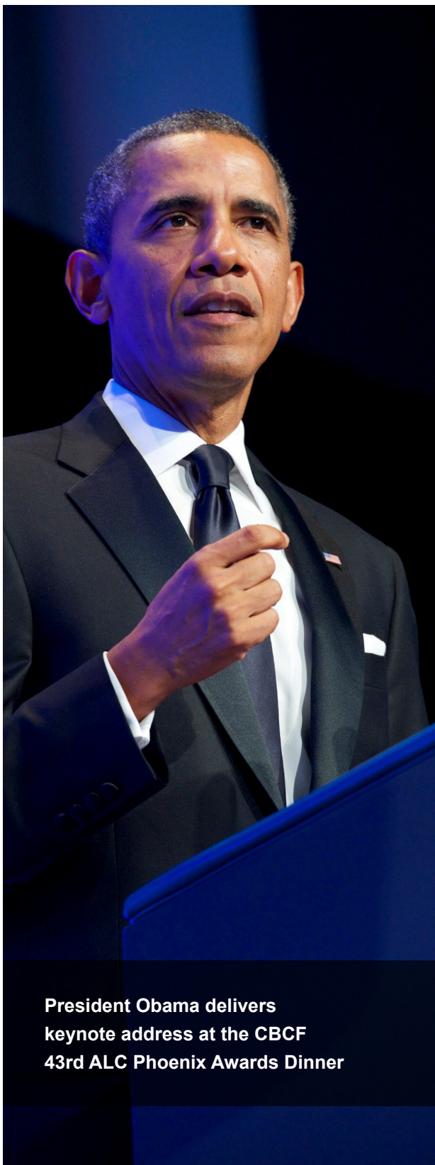
President Obama delivers keynote address at the CBCF 43rd ALC Phoenix Awards Dinner